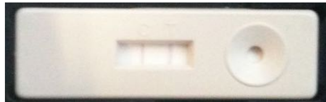
The IPRO LFD showing both the Control and Test Line

Measurement range for both ELISA and the POC sAA test is 31.25 - 4000 µg/ml.