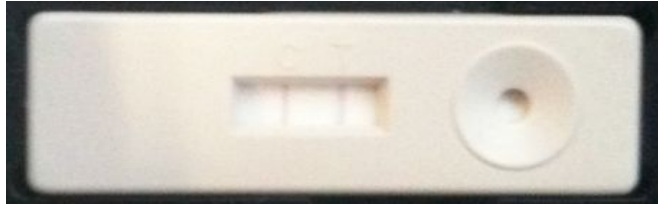
The IPRO LFD showing both the Control and Test Line

Measurement range for ELISA was 1.75 - 105 µg/ml and for the POC test was 1.6 - 120 µg/ml.